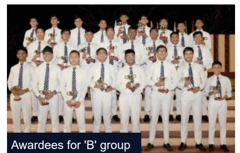
Awardees for 'B' group