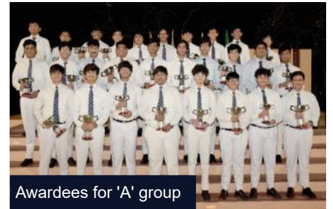
Awardees for 'A' group

The annual house report for the senior houses was held on 15th March 2025. Each house presented their house report with honour and passion. The awardees for Best-in-Sports (Group A and Group B), Best-in-Academics (Group A and Group B) and House Master's Cup are as follows: