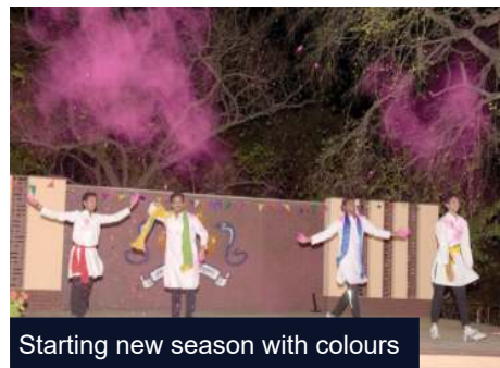
Starting new season with colours

The following day, the Madhav and Oval fields transformed into a canvas of colors as students celebrated with