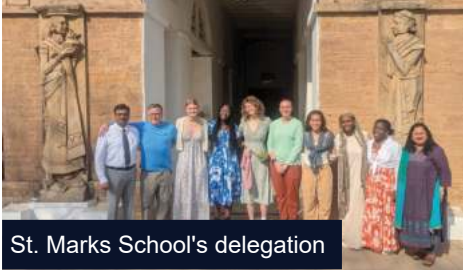
St. Marks School's delegation

A delegation of six students and two teachers from St. Mark's School, Boston, visited the school as part of a one-week exchange programme.