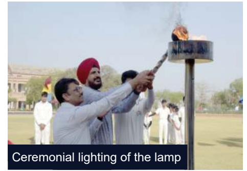
Ceremonial lighting of the lamp