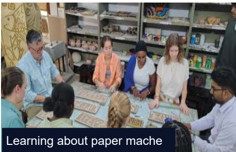
Learning about paper mache

During their stay, they actively engaged in classroom learning, immersing themselves in the academic environment. They also explored various sports, trying their hands at cricket, hockey, and basketball, fostering camaraderie with their peers. One of the most serene moments of their visit was at Astachal, where they experienced the tranquility of the setting sun in peaceful reflection. Their exploration continued through