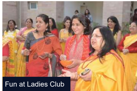
Fun at Ladies Club