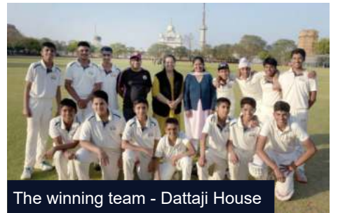
The winning team - Dattaji House

The individual positions are as follows: The Best Batter of the tournament -