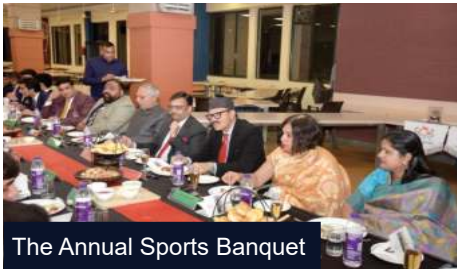
The Annual Sports Banquet

The 28th Annual Sports Banquet was held on 3rd March 2025. It was a celebration of achievements in sports, and a lesson in determination. The Chief Guest for the evening was Mr