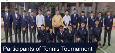
Participants of Tennis Tournament