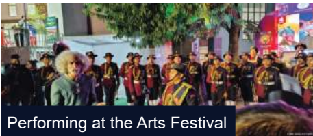
Performing at the Arts Festival