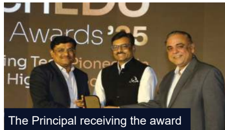
The Principal receiving the award

The Scindia School was honoured with Outstanding Standalone School in Tech Practices Award and Excellence