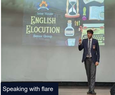
Speaking with flare

The Inter-House Senior Group English Elocution Competition was conducted on 23rd February 2025. The event featured two categories—Prose and Poetry, with participants demonstrating exceptional expression, clarity and command over language. The results for the same are as follows: