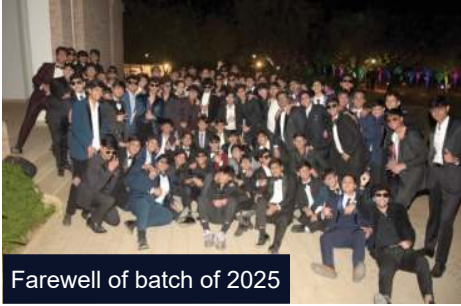
Farewell of batch of 2025

The Senior Houses bid farewell to the batch of 2025 on 8th February 2025.