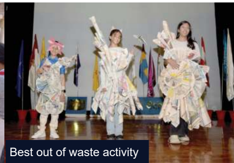
Best out of waste activity