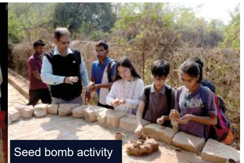
Seed bomb activity

Throughout the conference, participants engaged in Baraza sessions, discussing environmental issues and sustainability. Creative activities such as Nukkad Natak (street play), Best Out of Waste, Paper Mache, and Block Printing encouraged artistic expression while promoting environmental consciousness. A visit to the Fort Biosphere provided hands-on learning about ecological conservation, and the Seed Bomb Activity promoted afforestation. The Delegates also attended the Light and Sound Show at Gwalior Fort, offering them a glimpse into the city's rich cultural and historical heritage.