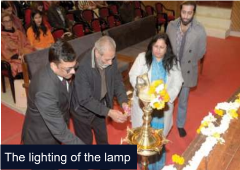
The lighting of the lamp

The Scindia School successfully hosted the Round Square Conference 2025 from 27th to 31st January, welcoming delegates from 19 schools to explore the theme of Environmentalism. The event featured engaging activities, beginning with ice-breaking sessions, followed by a mindfulness session at Astachal, fostering reflection and connection among participants.