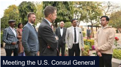
Meeting the U.S. Consul General