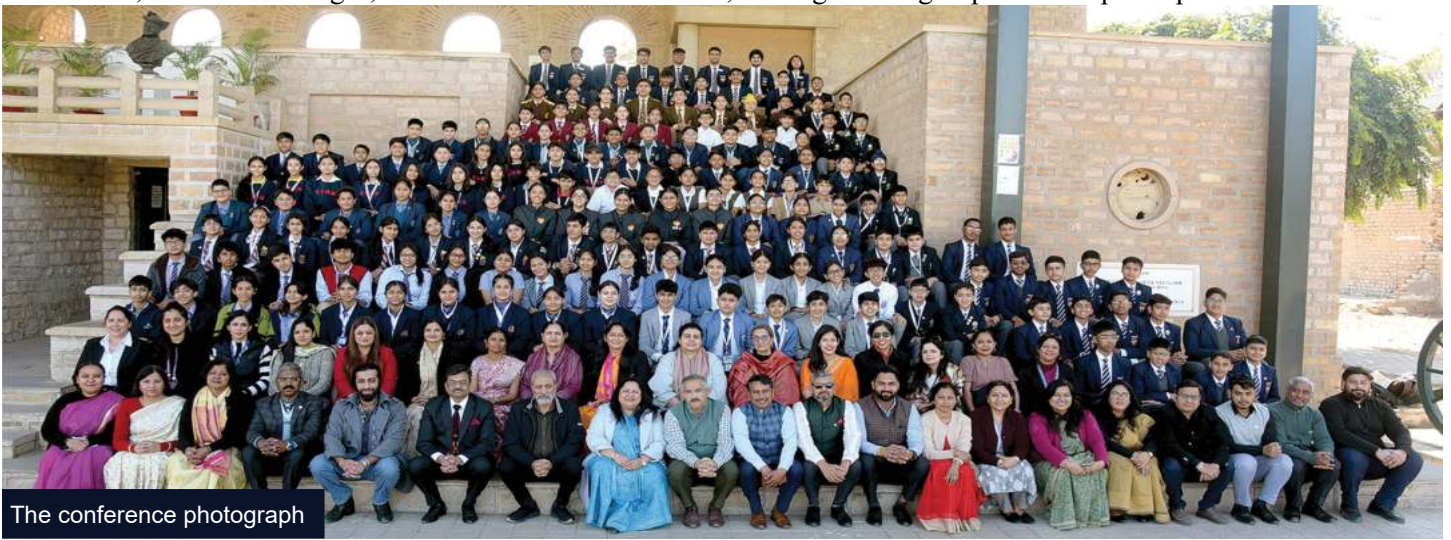
The conference photograph