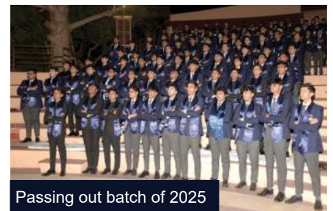
Passing out batch of 2025