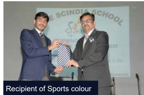
Recipient of Sports colour

Half and Full Colours are awarded to players who show extraordinary