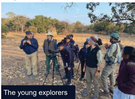
The young explorers