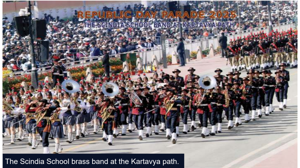
The Scindia School brass band at the Kartavya path.

A highlight of our experience was the opportunity to perform the Guard of Honour for esteemed dignitaries, such as the Chief of Naval Staff, the Air Chief Marshal and the Minister of State for Defence. We felt a sense of pride and reverence, bolstering our dedication to service and discipline, as we stood tall before such esteemed dignitaries. Each performance was a testament to our precision, discipline, and the values we uphold as cadets.