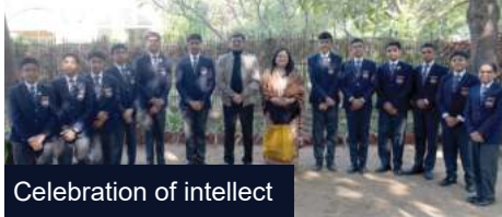
Celebration of intellect

The school organised the VP's Breakfast to celebrate the academic achievements