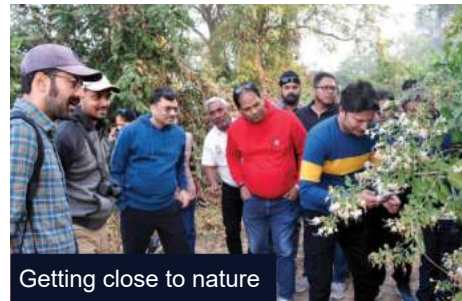
Getting close to nature