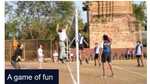
A game of fun

A friendly volleyball match was held in the afternoon of 25th November 2024,