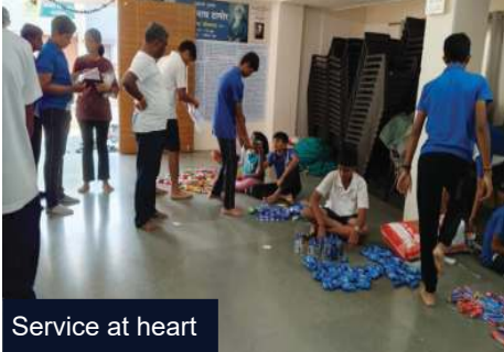
Service at heart