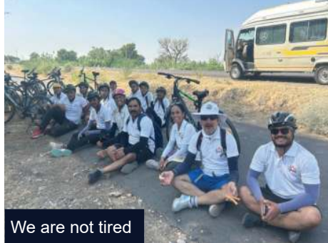
We are not tired