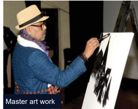
Master art work

Padma Shri Paresh Maity, a renowned artist known for his exceptional talent and dedication towards art visited