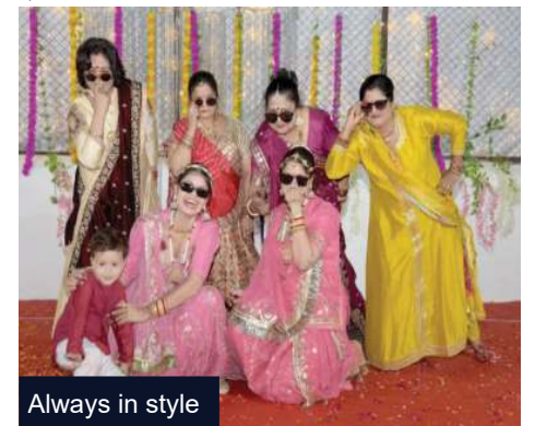
Always in style

20 नवंबर को लेडीज़ क्लब ने अपने वार्षिक दीपावली समारोह का आयोजन किया, जो उमंग, उत्साह और खुशियों से भरपूर रहा। इस भव्य कार्यक्रम में सभी सदस्यों के