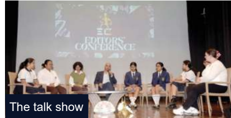
The talk show

In the evening, the delegates visited Bada, the bustling Gwalior market, to gain firsthand experiences and gather material for their newsletters. Later, the participants faced an unexpected