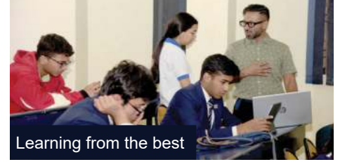
Learning from the best

the pressures of real-world journalism. Despite the tight deadline, they