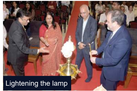
Lightening the lamp