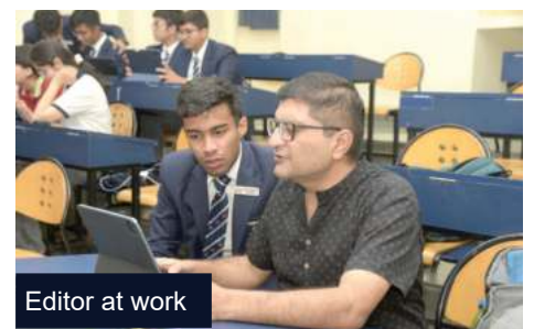
Editor at work

the Fortbiosphere, followed by the mesmerising Maan Singh Palace Light